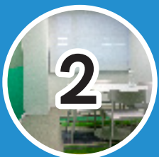
Quick meeting rooms