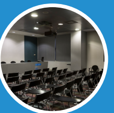
Fèlix Serratosa room 70 persones