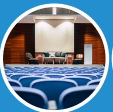
Antoni Caparrós Auditorium 140 people