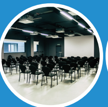
Dolors Aleu Hall 120 people