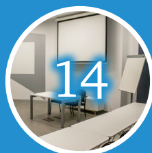
Meetings rooms for 4 to 40 people