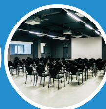
Dolors Aleu Hall 120 people