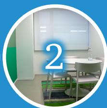
Quick meeting rooms