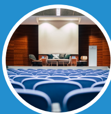
Antoni Caparrós Auditorium 140 people